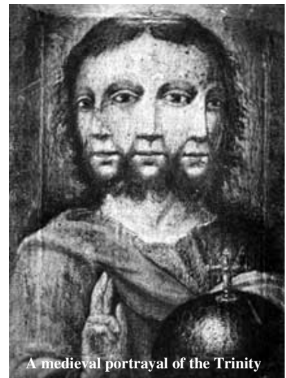
A medieval portrayal of the Trinity

Tertullian (AD 150–225) was the first to use the term Trinity in the early third century. He taught that there were three persons in one substance, though in his writings many times he spoke of them as separate beings. He also taught that there was an inequality of rank between Father, Son, and Holy Spirit (subordinationism). Parallel to this Origen (AD 185–254) theorized that when the Scripture said “today I have begotten you,” that “today” is really eternity for God. Thus, the concept of “eternal generation” or that Jesus was “eternally begotten” came into the church. He contradicted Tertullian by teaching that nothing in the Trinity can be called greater or less but at the same time thought that since the Spirit was the first creation of the Father through the Son, the Spirit is “God” but not “the God.” In both of these